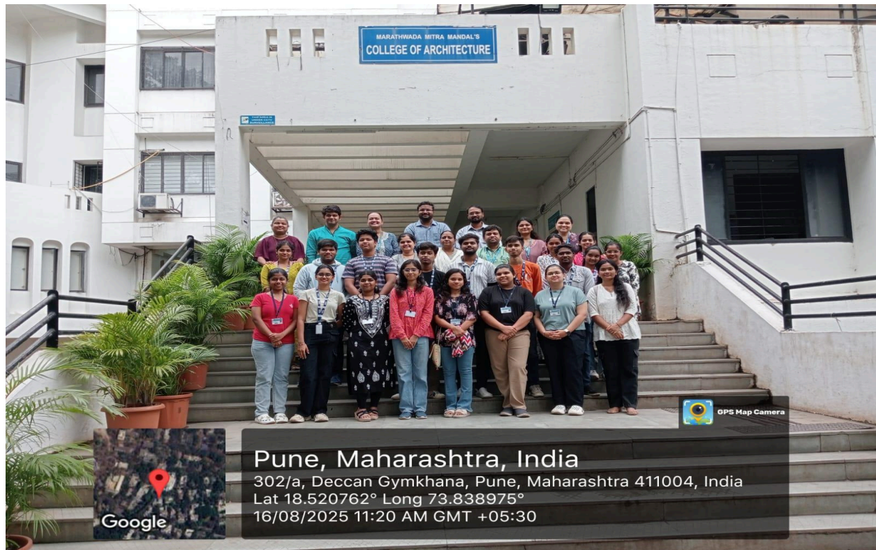
A group photo with the Guest, team and the selected candidates.