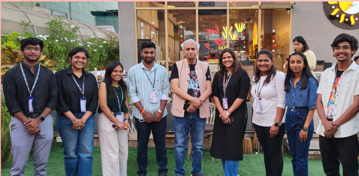
PIFF Director Dr. Jabbar Patel and Students of MAJMC

MAJMC Students worked as a part of media team The 23rd Pune International Film Festival (PIFF) was a celebration across 11 screens at three venues: PVR Icon in Pavilion Mall, 13 to 20. Jointly organized by the INOX in Camp, and Cinepolis in Pune Film Foundation and Westend Mall. In the competitive sections, the French film 'Armand' won the Best International Film award, from 81 countries, reflecting its commitment to promoting a healthy film culture in Pune. Overall, PIFF 2025 reinforced its status as a significant platform for cinematic excellence, offering filmmakers and enthusiasts an opportunity to engage with diverse narratives and filmmaking styles from around the world.