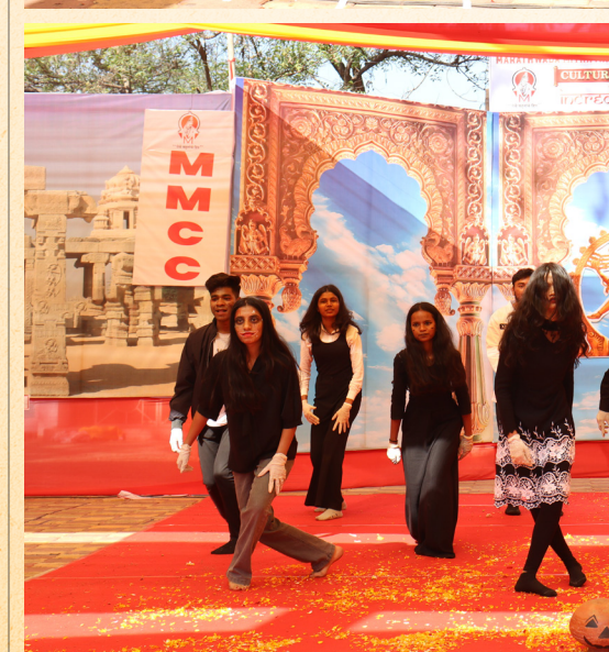
Glimpses of participants showcasing different festivals celebrated at MMCC