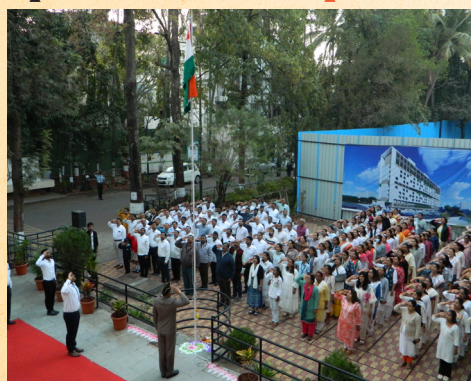
Flag Hoisting at MMCC

He led the audience in taking an oath to prioritize a disciplined and