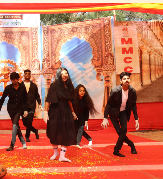
celebrated in India performed on the Cultural Fest at MMCC (MAJMC Part1)