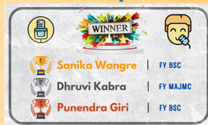
WINNERS of Elocution Competition

Marathwada Mitra Mandal's College of Commerce (MMCC) recently hosted a successful intra-college elocution competition, showcasing the impressive oratory skills of its students. Held on January 18, the event featured participants delivering compelling speeches in English, Hindi, and Marathi. Topics ranged from the impact of artificial intelligence to Swami Vivekananda's vision for youth and the role of responsible representatives. The competition provided a platform for students to express their views and engage with important contemporary issues.