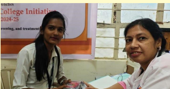
Anemia Free Campus