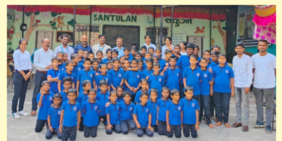
Visit to Santulan Bhavan