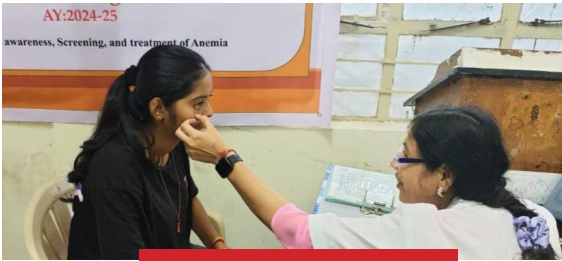
Anemia Free Campus