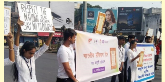
Jan Jagruti Abhiyaan