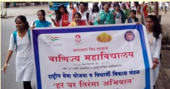
Har Ghar Tiranga Abhiyaan