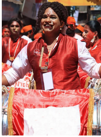
पहिलं पारलिंगींचं 'शिखंडी' ढोल-ताशा पथक

भारतातील पहिलं पारलिंगींचं (तृतीयपंथींचं) 'शिखंडी' ढोल-ताशा पथक हा एक ऐतिहासिक आणि सामाजिक दृष्टिकोनातून महत्त्वाचा उपक्रम ठरला आहे. 'शिखंडी' हे पथक पुण्यात स्थापन झालं असून, यामागे समाजात दुर्लक्षित असलेल्या पारलिंगींच्या अस्तित्वाला मान्यता आणि सन्मान मिळावा हा प्रमुख उद्देश आहे. या पथकाची संकल्पना पुढे आणताना, पारलिंगी समाजाला केवळ मनोरंजन किंवा कोणत्याही रूढी परंपरामध्ये न टाकता, त्यांना एक वेगळं व्यासपीठ देण्याचा प्रयत्न करण्यात आला आहे. गणेश विसर्जन मिरवणुकीच्या ढोल-ताशा पथकांमध्ये सहभागी होण्याची पारलिंगींची पहिलीच