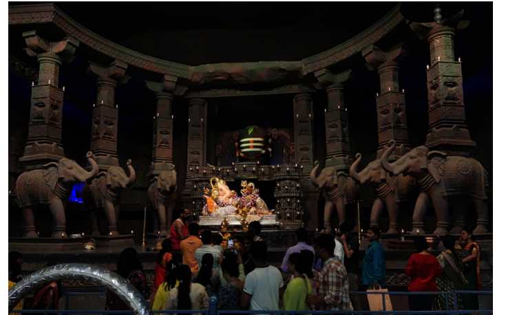
Mandai ganpati, Pune.