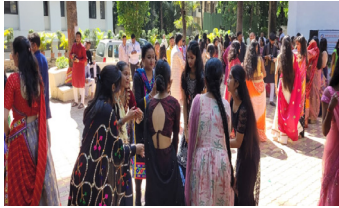
दांडियाचा आनंद घेताना विद्यार्थिनी.