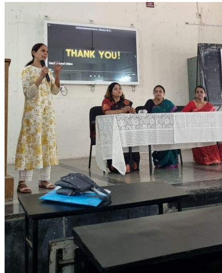
Day 1 : Teachers Introduction