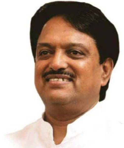
Hon. Late Shri Vilasrao Deshmukh Ex. President, Marathwada Mitra Mandal