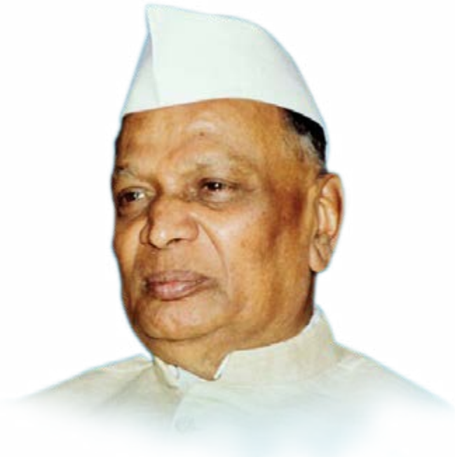
Hon. Late Shri Shankarrao Chavan Founder President, Marathwada Mitra Mandal