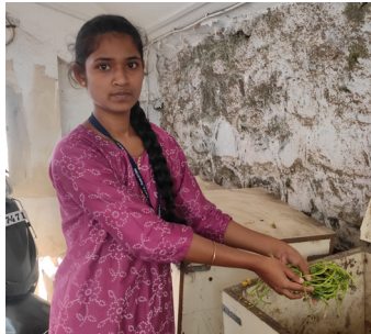
Student Volunteer at the Nirmalya collection activity