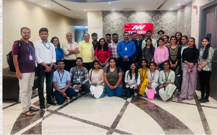
Journalism students & professor at News Nation - Noida