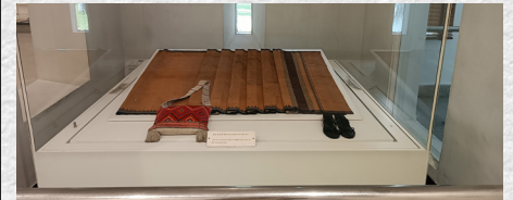
Indira Gandhi's Essence captured.

The students of communication and journalism visited 'Indira Gandhi Memorial' Museum on April 14 during their study tour at New Delhi.