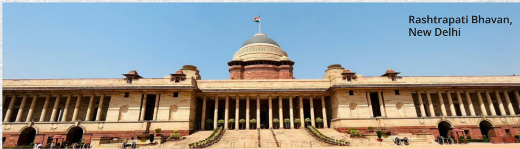
Rashtrapati Bhavan, New Delhi

MMCC's Students visited the Rashtrapati Bhavan, famous as a masterpiece of Indian architecture, on April 13 during their study tour to Delhi. The entire group was allotted with a guide for understanding the overall structure of the President's house.