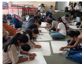
Students of Computer Science Department designing posters for Poster Making Competition.

The Computer Science Department organized a poster making competition on August 12, Saturday for the students of first year of B. Sc. (Computer Science) and BBA (Computer