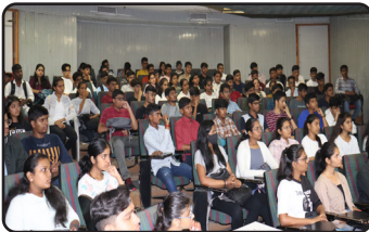
First Year BBA and BBA (IB) students at the induction