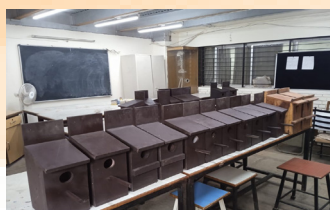
Hornbill nests donated by Ekbote Furnitures.

M a r a t h w a d a Mitramandal's College of Commerce has always been conducting environmental awareness activities. These activities are conducted, keeping in mind the conservation of the environment and its resources.