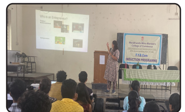
Guest session at Commerce Dept. Induction