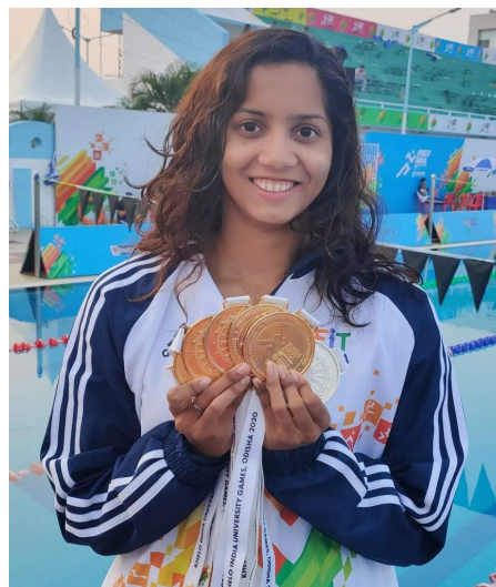
Sadhvi MMCC's Swimming champion winning medals and hearts