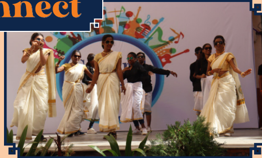
Glimpses of the participants of Folk Fusion and their performances.

The cultural dept. of MMCC organized a week-long cultural fest comprising a number of competitions and events from March 23, 2023.