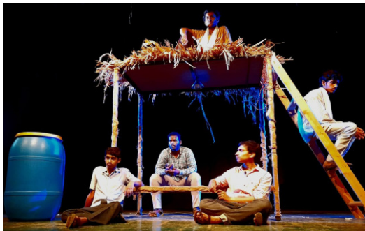
A still from the play Poshter.