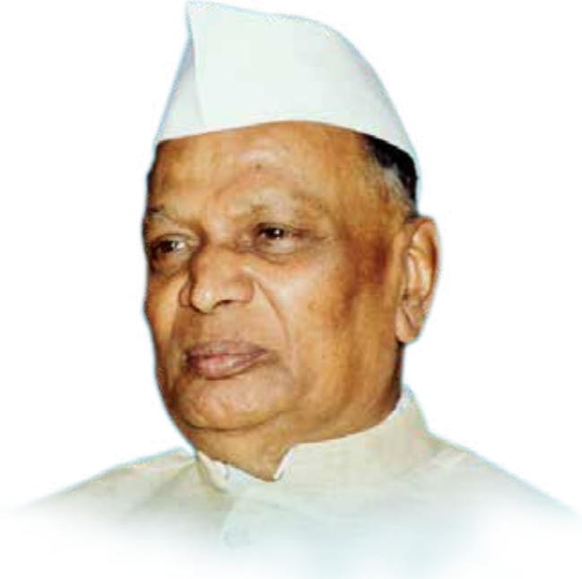
Hon. Late Shri Shankarrao Chavan Founder President, Marathwada Mitra Mandal