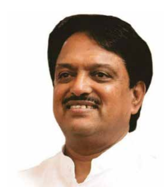
Hon. Late Shri Vilasrao Deshmukh Ex. President, Marathwada Mitra Mandal